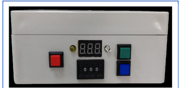
Fig 1 : the monitoring box of the system.