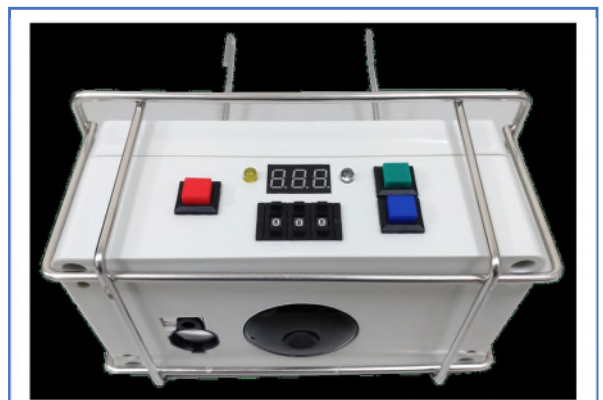
Fig 2 : the bottom of the monitoring box.